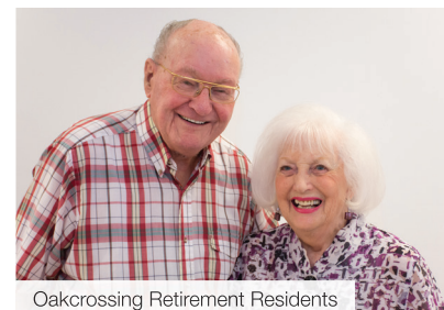
Oakcrossing Retirement Residents

of our staff told us they would recommend our organization to family and friends who require care.